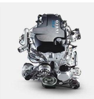
3.0-litre F1C Diesel engine